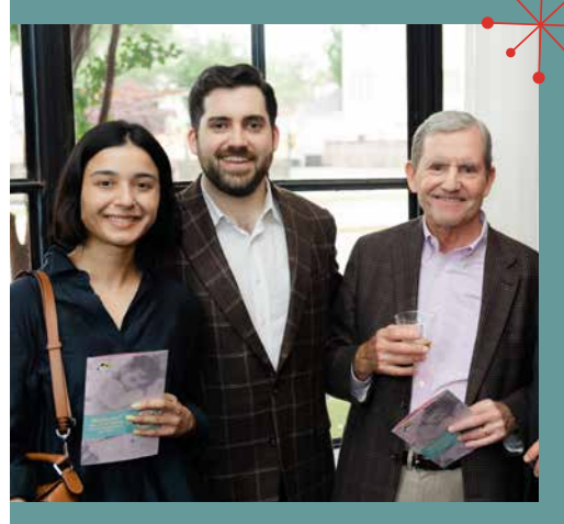
We are grateful to our dedicated supporters for advancing the work of Santa Maria.

Decorations: Christ Church Sugar Land Dessert: HeightsPremium Catering Services Photography & Multimedia: Up In the Air Films