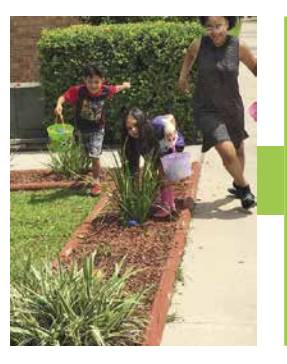
Our long time supporters from WALMART CENTRAL FILL visited Santa Maria on Saturday April 15 to donate Easter Baskets and organize an Easter Egg Hunt for our children and families! Thank you very much for a great afternoon!