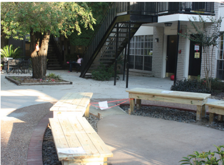
Remodeled courtyard at Jacquelyn House courtesy of The Williams Companies

As not to be out done, The Williams Companies came out in full force to Jacquelyn House recently to make some much needed repairs to the fencing, laundry rooms and remodeling of the courtyard. As a first year Day of Caring partner with Santa Maria, The Williams Companies volunteers numbered more than 60 with well over 550 hours donated to the project.