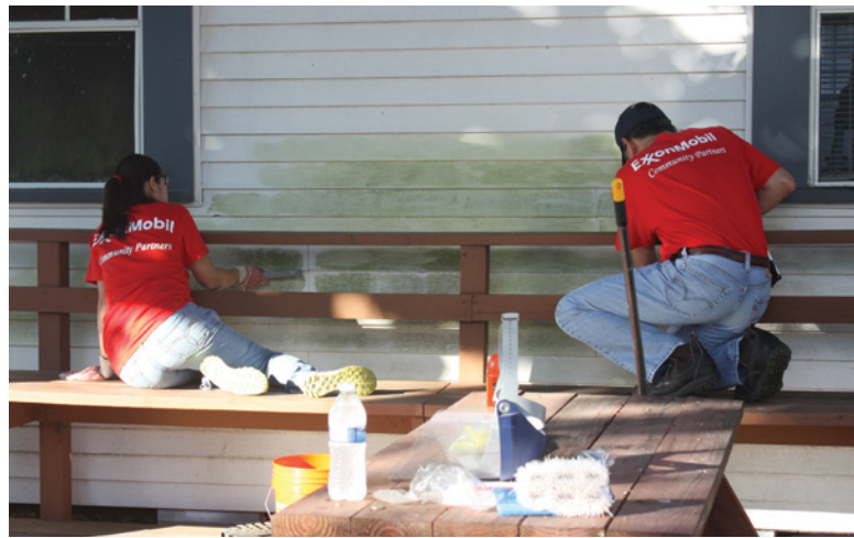
ExxonMobil volunteers provide a much-needed coat of paint to Paschall House.

As not to be out done, The Williams Companies came out in full force to Jacquelyn House recently to make some much needed repairs to the fencing, laundry rooms and remodeling of the courtyard. As a first year Day of Caring partner with Santa Maria, The Williams Companies volunteers numbered more than 60 with well over 550 hours donated to the project.