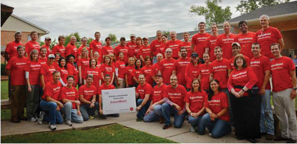
The ExxonMobil Day of Caring Team at Bonita House

We are so thankful for their time, dedication and support of Santa Maria.